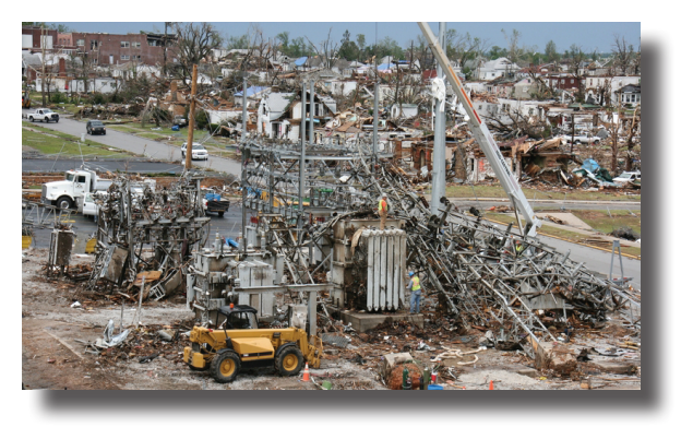
At right, workers install a transformer at The Empire District Electric Company's Substation 59. Above, the substation was reduced to rubble after the 2011 tornado.