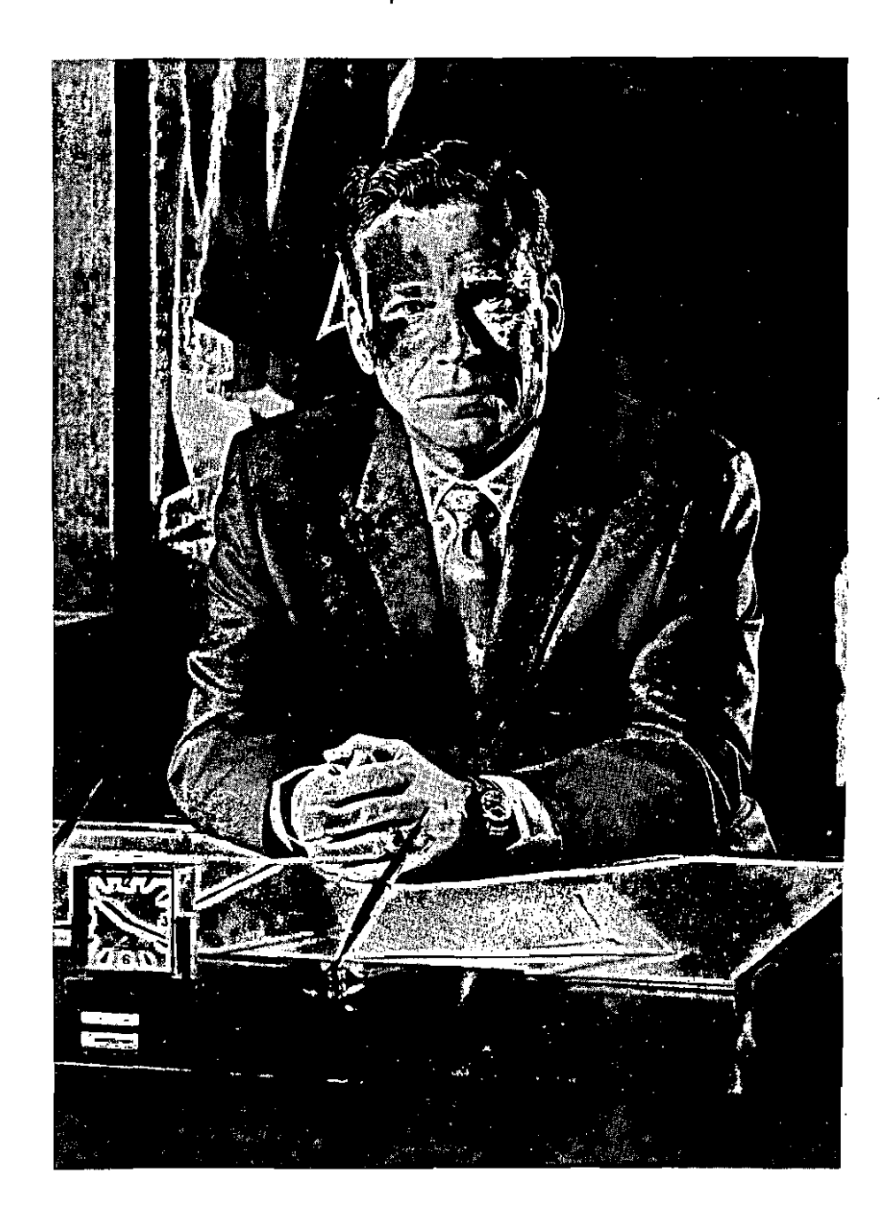
WARREN E. HEARNES GOVERNOR