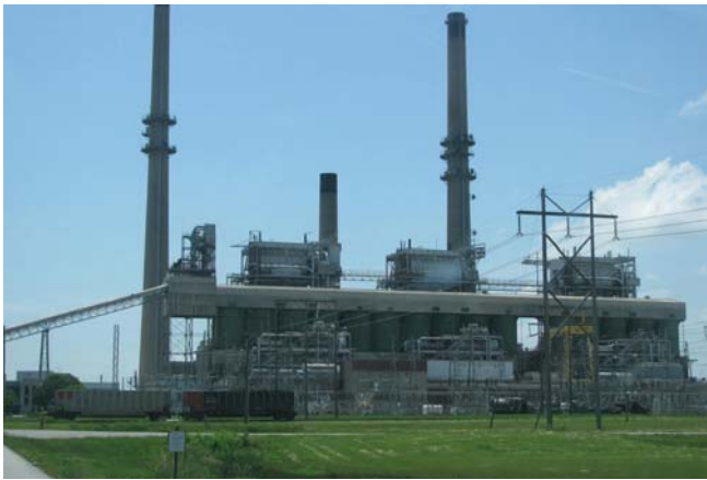
Kansas City Power & Light's Montrose Power Station, a coal-fired plant located in LaDue, Mo.

Regulated electric companies in Missouri sold approximately 61 million megawatt-hours of electricity in 2010. On average, a megawatt provides power to about 1,000 homes at a given point in time.