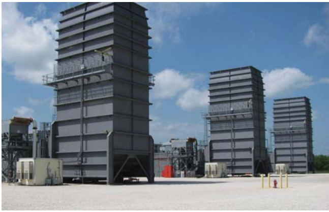
Natural gas combined cycle turbines at the South Harper Facility in Cass County.

CT's are frequently used as power "peaking" devices when electricity demand periods are highest. A potential downside to combustion turbines is their use of traditionally more costly fuel, such as natural gas or oil.