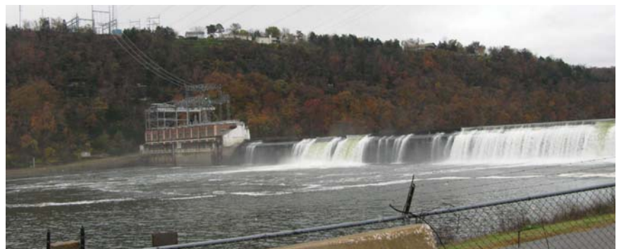
The Powersite Dam area near Forsyth, MO is part of the Ozark Beach Hydroelectric Plant located in Taney County. It is owned and operated by The Empire District Electric Company.

Hydropower is a clean energy source that does not produce emissions like power plants that burn fossil fuels. The disadvantages of hydropower include the cost to the surrounding